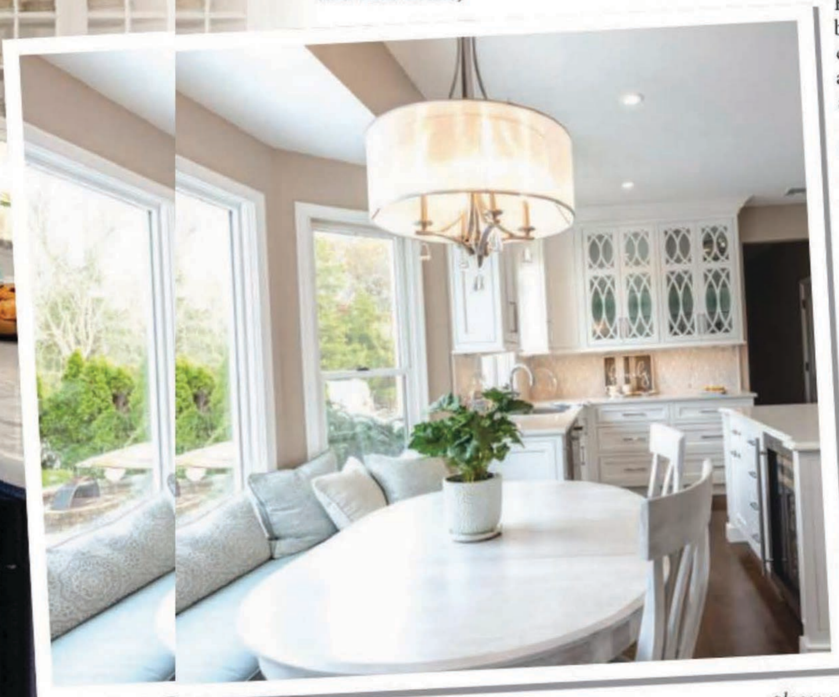
please see RENOVATION, page 6

If a homeowner is unable to redo their entire kitchen, there